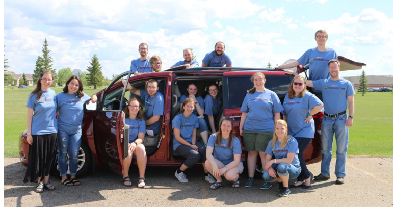
Each summer the Young Disciples missionaries load up vans and travel from parish to parish leading vacation Bible schools and teen retreats.